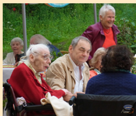
An excursion with volunteers