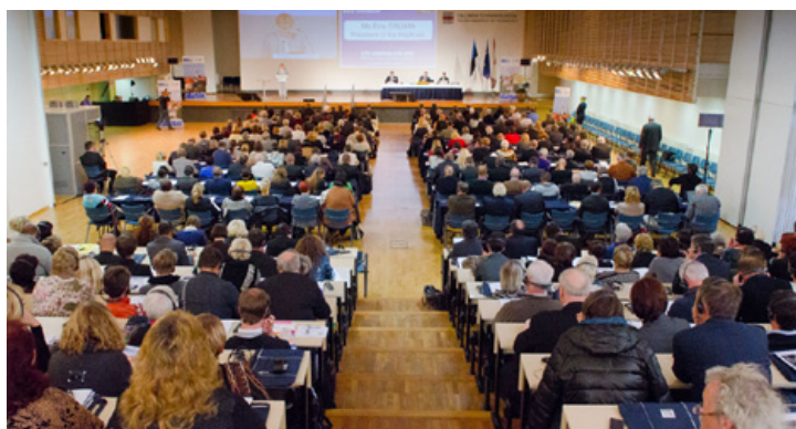
Plenary hall of the 13th E.D.E. Congress